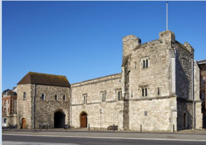
God's House Tower

In the 18th century the medieval God's House Tower and gateway had been transformed into the town's main prison. One of the punishments meted out to prisoners found guilty of certain crimes was to transport them to the colonies in America. Prisoners were routinely sent there as punishment and to help the development of the colonies through their labour.