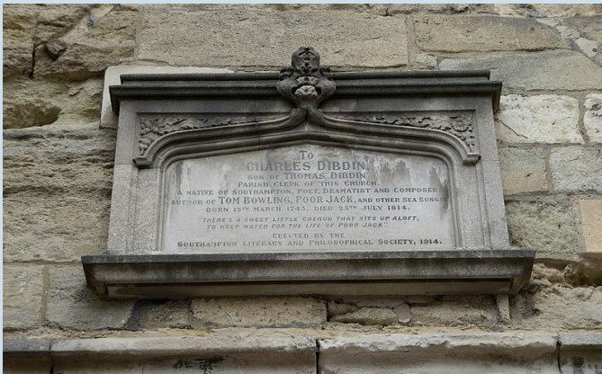
Charles Dibdin Memorial Plaque

On the tower is a memorial tablet to Charles Dibdin, the son of a parish clerk of Holy Rood, who was baptised here in 1745 and who wrote songs and ballads about the sea, including 'Tom Bowling' – still sung on the Last Night of the Proms. The song was inspired by Dibdin's brother who was 29 years his senior and captain of a ship which was struck by lightning. The song contains the line 'His form was of the manliest beauty, his heart was kind and soft, faithful below he did his duty – now he's gone aloft.' Napoleon rated Tom above Nelson for inspiration and it is said he brought more men into the navy than the press gangs. Dibdin also wrote the first-known version of the pantomime that we know as Jack & the Beanstalk .