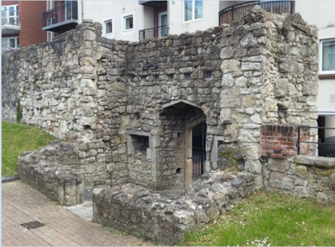
Site of Friary and Sugar House

included coffee houses, circulating libraries and assembly rooms where drinking, tea, chocolate and coffee was the height of fashion.