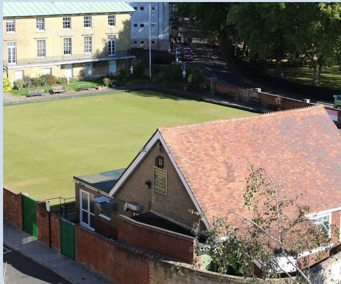
The 'Ditches' Old Canal Walk

The Ditches was so named as it was where the medieval town moat ran: from God's House, up the east side of the town, and around to the Bargate. By the end of the 18th century, the old town moat was repurposed as part of the Southampton to Salisbury canal. By the dawn of the 19th century, Southampton was about to return to being a busy working port.